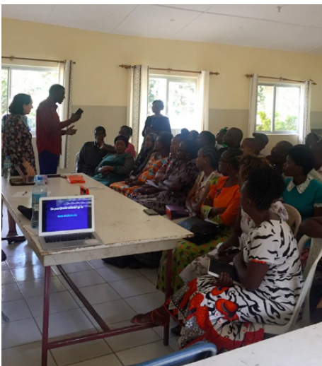
Launch of the mobile phone training in Mwanza