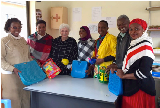
Delivering learning materials