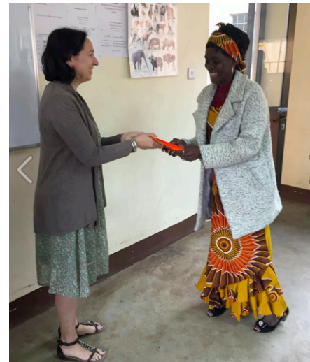
Presentation of tablet to a jackpot winner